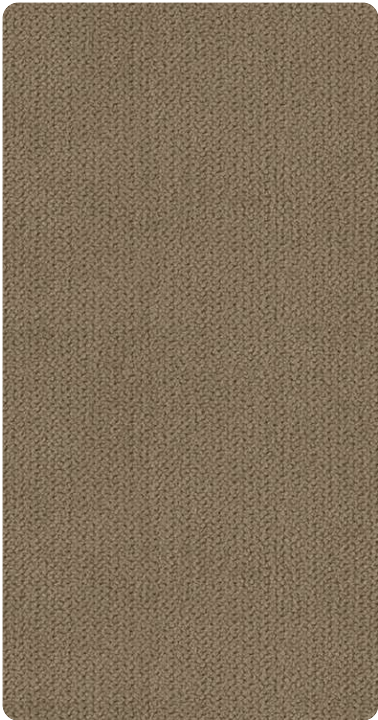
GRUNT MOTH GREY