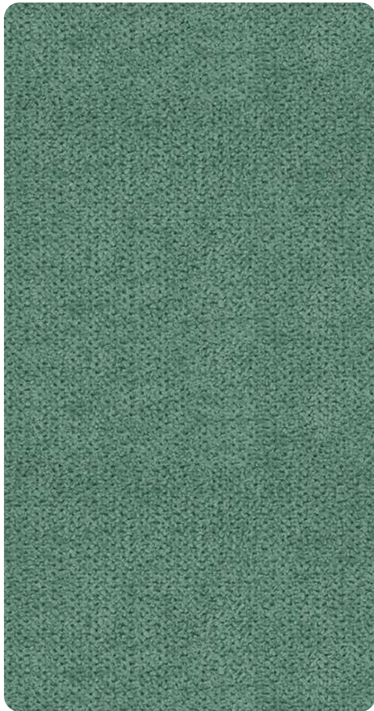
GRUNT BABY BLUE